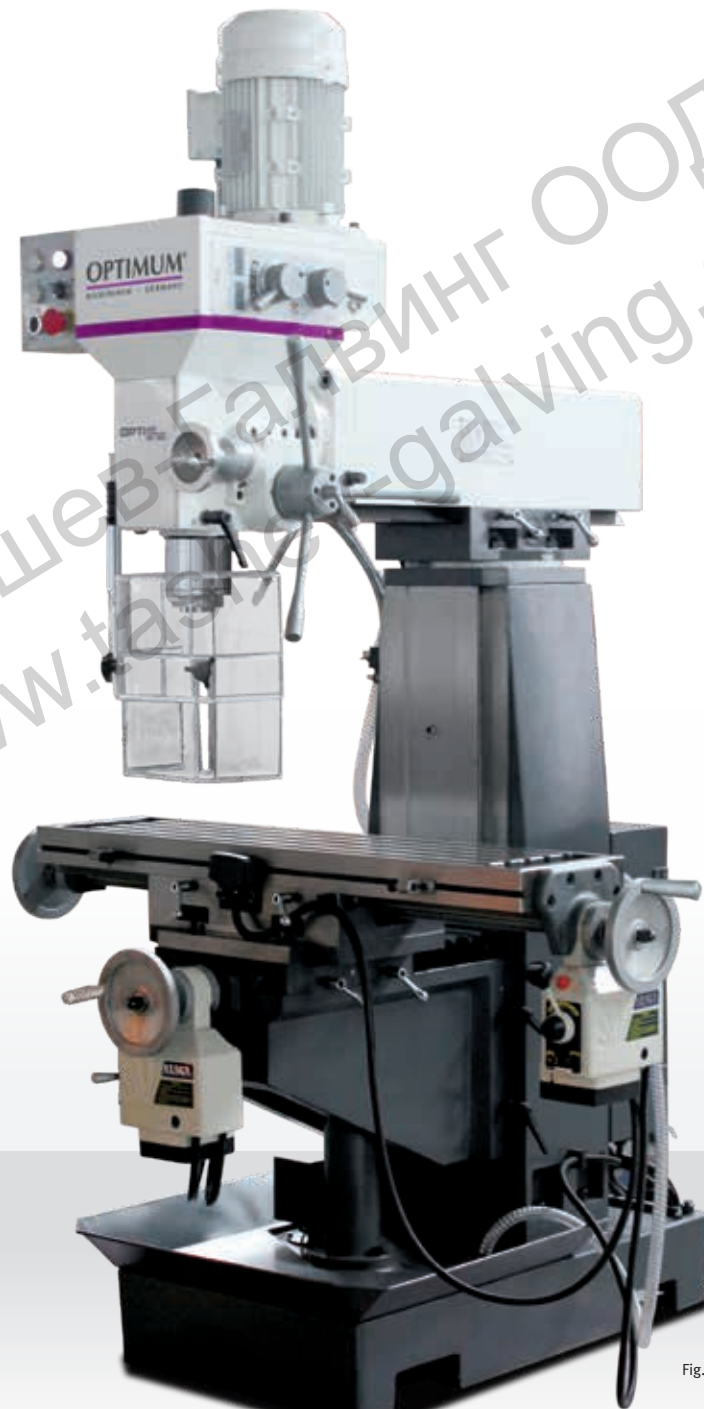
Fig.: MT 50E